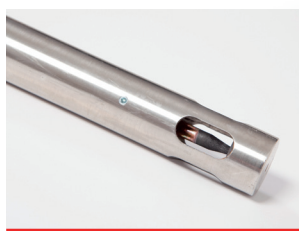
Igniter, cable, plug, socket & transformer