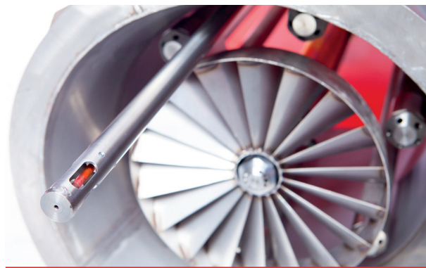
Igniter in Operation