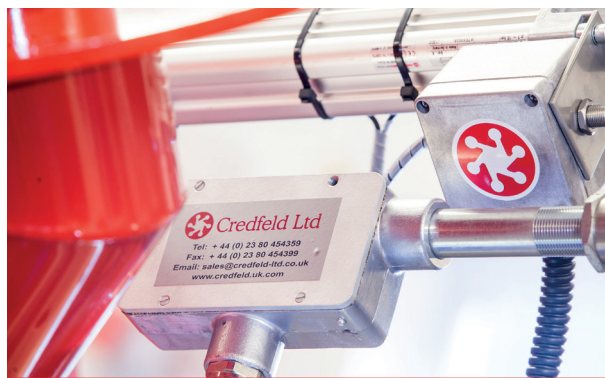
Zone 1 Portable System